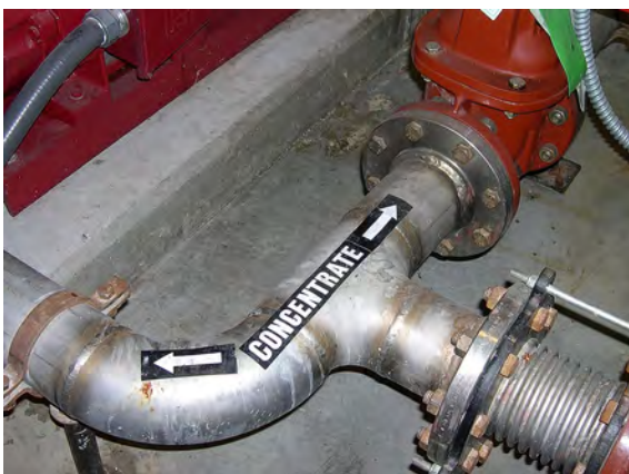
Fire suppression room, PFAS concentrate piping— a ticking time bomb