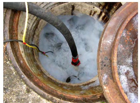
Sucking foam from sewer