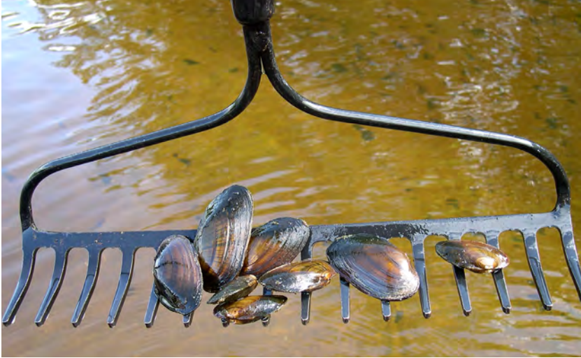
FOMB samples mussels for PFAS in the Androscoggin.

perfluoroheptanoic acid (PFHpA), and perfluorodecanoic acid (PFDA). An interim standard of 20 ppt for the six PFAS (alone or in combination) is immediately in effect. A rule-making process is currently taking place to establish PFAS Maximum Contaminant Levels in Maine.