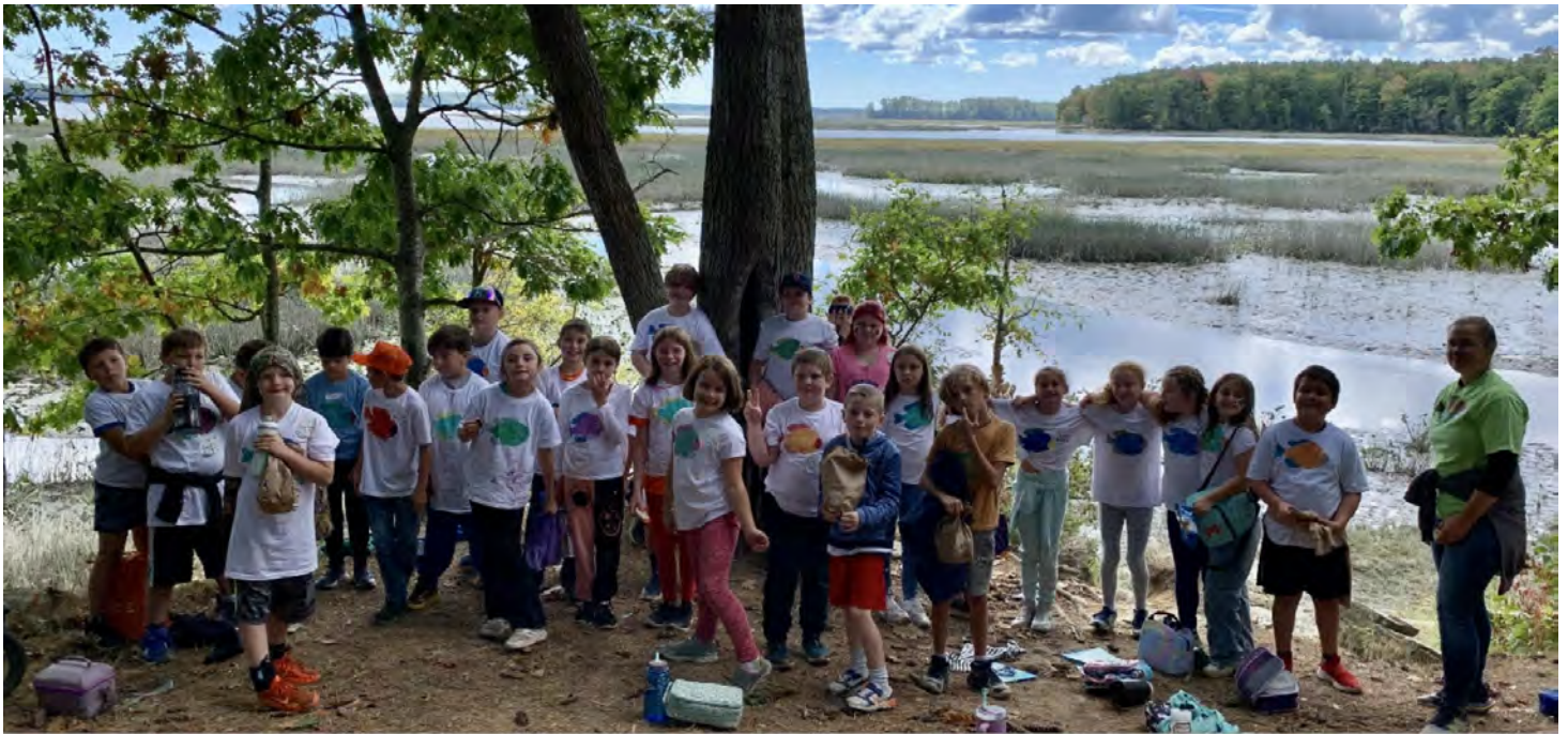
Lunch break by the Bay

Printed on Genesis Writing. 100% Recycled, 100% post-consumer waste, processed chlorine-free.