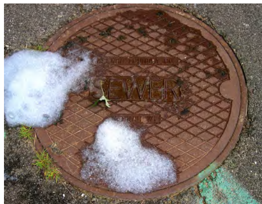
PFAS upwelling through the sewer manhole covers

FOMB volunteers were on site by midday, photographing both spill areas we could see and response efforts. Besides cleanup, a focus of the DEP was rapid testing to establish baseline data. Thanks to member support , FOMB could contribute in a major way, since on our own and in cooperation with the Brunswick Sewer District, Brunswick Area Citizens for a Safe Environment