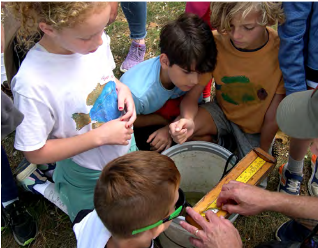
Inspecting the haul