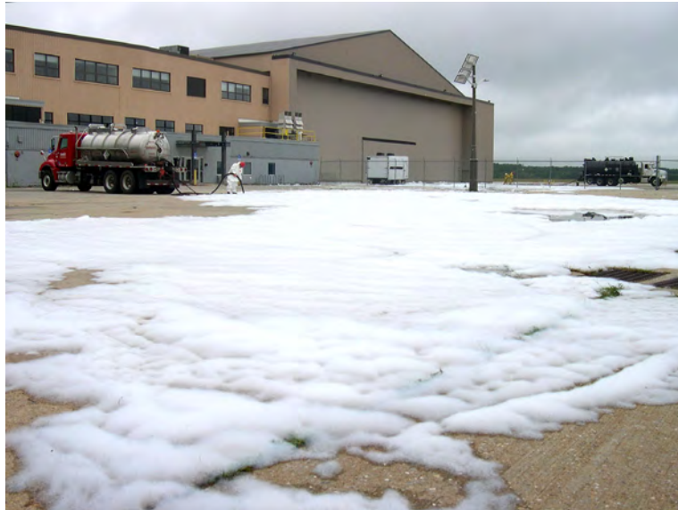
Clean Harbors vacuums the tarmac.

Within hours, the AFFF had entered surface waters that largely drain southeast through a chain of ponds to Merriconeag Stream, which flows into Mare Brook and out to Harpswell Cove, home to a thriving shellfish industry. The AFFF also entered the sewer system from whence it flowed to the Brunswick Sewer District (BSD) Plant and, untreated for PFAS, directly into the tidal Androscoggin River and Merrymeeting Bay . PFAS foam was all over the Hangar 4 and Pond A vicinity, coming up through the sewer manholes and being vacuumed up on the tarmac by Clean Harbors under DEP supervision.