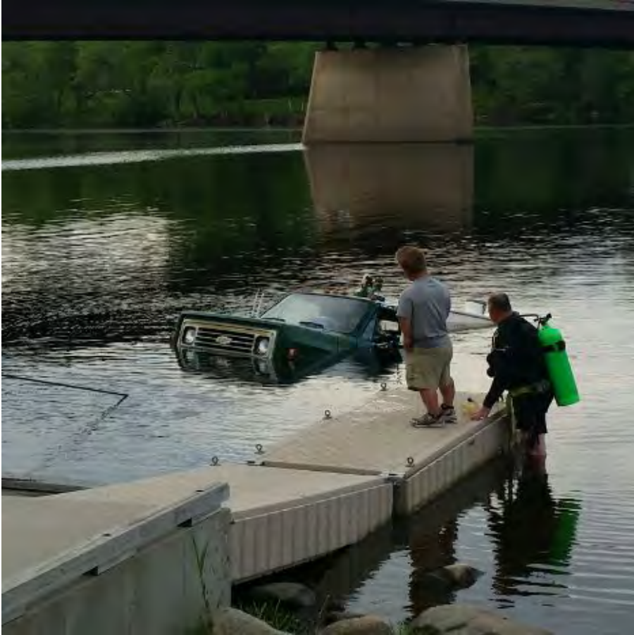
The Turtle's last gasp

Stocking operations had moved upriver 17 miles with the removal of Edwards Dam in 1998. Edwards was the first working hydroelectric dam in the United States to be removed. Now we got our broodstock from Ft. Halifax dam in Winslow at the mouth of the Sebasticook River. Ft. Halifax dam was removed in 2008. Then we moved to get our fish from the now operational fish lift at Lockwood dam in Waterville. This site put us close to the Shawmut impoundment that has a lot of great blueback herring habitat. The Turtle continued to serve admirably. Fill with water and fish at Lockwood and then drive up to the Shawmut boat launch. Dump your load and drive back to Lockwood.