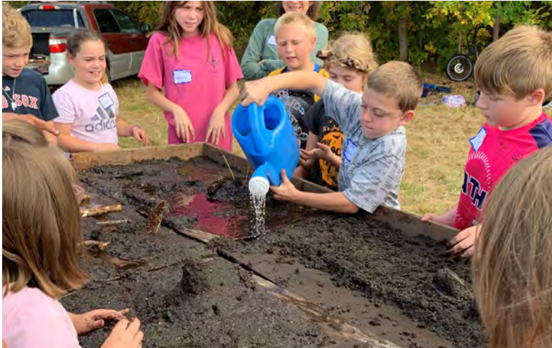
It's raining in the watershed.